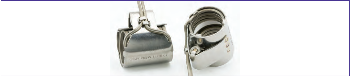
Microcoil heaters with axial screwed clamp band.