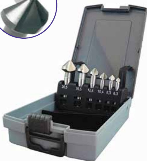
6 Piece Hales Counter-sink set in case